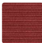
Red (special order)