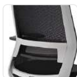
'BOOST' Adjustable Lumbar Support