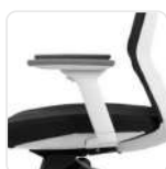
Multi Directional Adjustable Arms