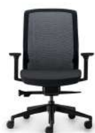
Aveya - Black