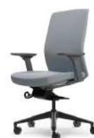
Aveya Fully Upholstered - Black