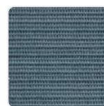
Steel Blue (special order)