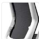
'INVISI' Adjustable Lumbar Support