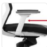
Adjustable Seat Depth