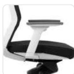
Standard Seat Foam