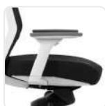
Plush Seat (Extra Foam)