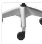
White Nylon Base