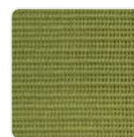
Green (special order)