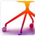
4 Way Swivel Base (Other Advanta Standard Powdercoat Colour) - Fixed Height