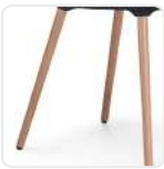
Beech Timber Legs