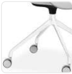
4 Way White Swivel Base - Fixed Height