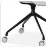
4 Way Black Swivel Base - Fixed Height