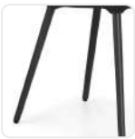
Black Timber Legs