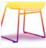
Sled Base (Other Advanta Standard Powdercoat Colour)