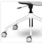
5 Way White Swivel Base - Adjustable Height