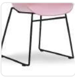
Black Sled Base