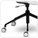
5 Way Black Swivel Base - Adjustable Height