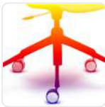
5 Way Swivel Base - Adjustable Height (Other Advanta Standard Powdercoat Colour)