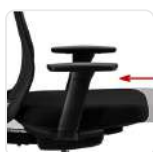
Adjustable Seat Depth