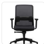
Assembled - Ready to Use