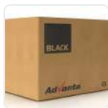
Boxed - Unassembled