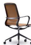
Meta Chair - Tan