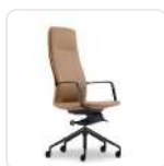
Black Base and Arms