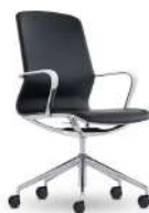
Meta Chair - Black