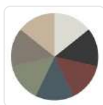
Advanta Standard Powder Coat Colour Base and Arms