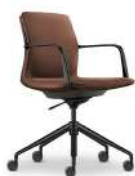
Million Chair - Low Back