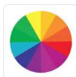
Specified Custom Powder Coat Arms and Base (MOQ 30)