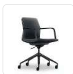
Black Base and Arms