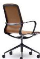
Meta Chair - Tan