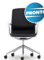
Meta Chair - Black 'Pronto'