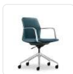
Polished Aluminium Base and Arms