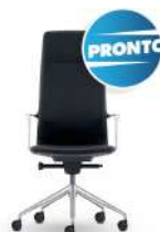
Million Chair - High Back 'Pronto'