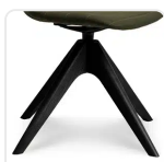
Swivel Base - Custom Black Stain