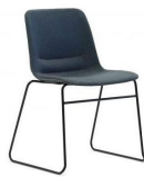
Unica Sled Upholstered