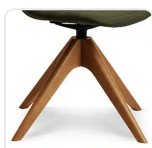
Swivel Base - Oak Stain