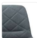
Comfort Diamond Quilted Upholstery Detail