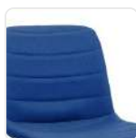
Comfort Straight Quilted Upholstery Detail