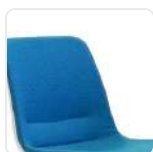
Duo Upholstery Detail