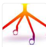
Other Advanta Standard Powdercoat Colour (special order)