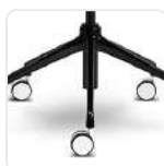
5 Way Base - Adjustable Height