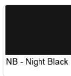
NB - Night Black