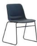
Unica Sled Upholstered