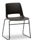
Unica Sled PP