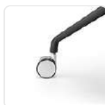
Chrome Castors / Black Tyre