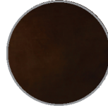
ANTIQU Brass Patina