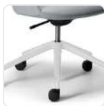
White - Swivel & Height Adjust Base with 'Free Motion' active tilt seat