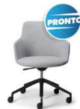
Saba – Meeting 'Pronto'