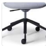
Black - Swivel & Height Adjust Base with 'Free Motion' active tilt seat