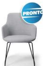
Saba Armchair 'Pronto'