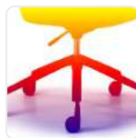
Swivel & Height Adjust Base with 'Free Motion' active tilt seat (Other Interpon Standard Powdercoat Colour)