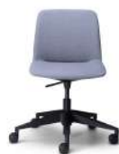
Twofour Swivel 5 Way Upholstered